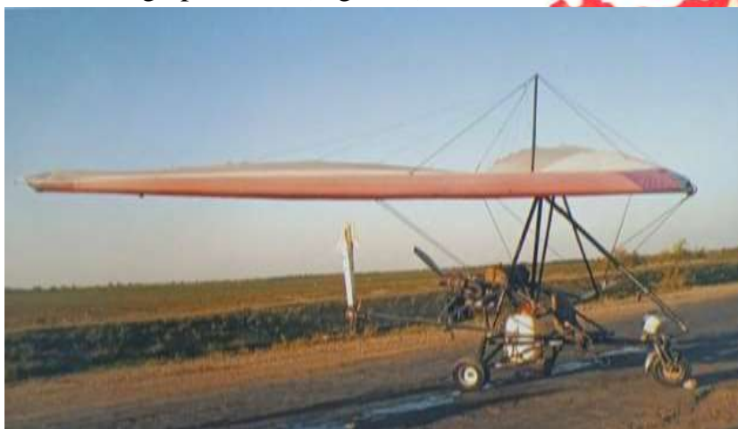
Figure 1. Poisk-06 SX Model Desert Plant Seed Sowing Device

Currently, “AGRO-PARVOZ” MAPE primarily employs Poisk-06 SX model motodeltaplanes, which have been specially equipped for performing agro-technical tasks in seed-sowing operations (Figure 1).